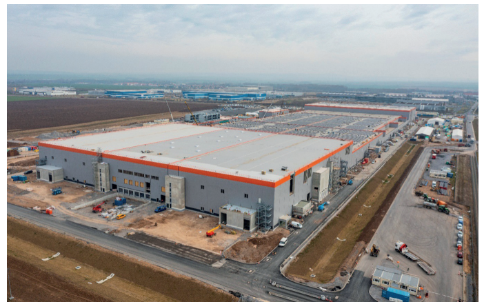
Currently still a construction site: Plant G2 for battery cell production

The CATL team also relies on digital solutions to control maintenance. The data basis for key figures is automatically recorded via the software, making evaluations available at the push of a button. In this way, impending weak points can be identified at an early stage and counteracted.